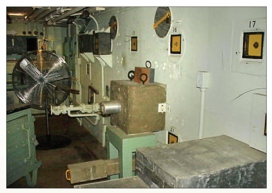
Figure 7. Upper room, where radioisotopes were prepared, after 1945. Radioisotopes were produced by bombarding chemical elements with neutrons from the nuclear chain reactions or fissioning—that occur inside a nuclear reactor. Radioisotopes are used in various applications for medical, industrial, agricultural, military, space, and scientific research. Prepared radioisotopes include iodine-131, phosphorus-32, and carbon-14. The reactor stopped operation in 1963.

thus shown to be erroneous.<sup>17</sup> The (extremely faint) X-ray lines claimed to belong to a new element by Hopkins and others now were known to have been due to impurities which could never be completely removed in those days before ion exchange chromatography (unfortunately, the original analyzed samples are no longer available,<sup>7</sup> and the exact composition of these is not known).