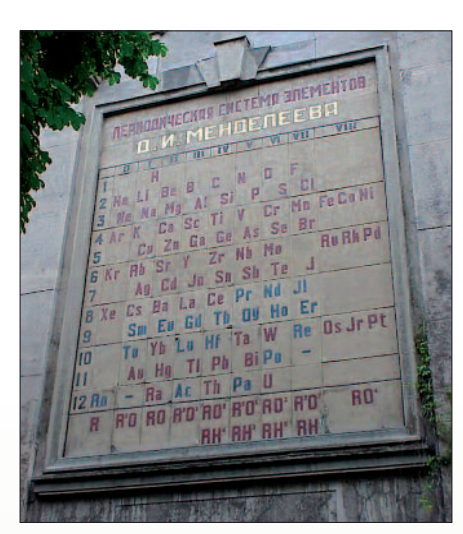
Figure 11. The "Wall" Periodic Table in St. Petersburg, at the Metrology Institute, 19 Moskovsky Pr., St. Petersburg, Russia (N59° 55.08 E30° 19.05), constructed in 1935.<sup>22</sup> Two of the original elements included in this table—illinium and masurium— were eventually discredited. However, illinium ("JI") remains, while masurium (which was originally assigned for element 43; directly above the "JI," between "Mo" and "Ru") has been scraped off, probably for political reasons, rising from painful memories of World War I battles in the Masurian region.<sup>1b</sup>

And yet the memory of illinium lives on in St. Petersburg, Russia! On the "Wall Periodic Table" erected in 1936 at the Metrology Institute (where Mendeleev was employed his later years), illinium still stands (Figure 11)—a ghost reminding us of the thousands and thousands of hours of crystallizations necessary to deliver a handful of new elements to the chemist's laboratory shelves. This element—albeit spurious—is the only one on this Mendeleev wall which was "discovered" by a member of AX\Sigma .