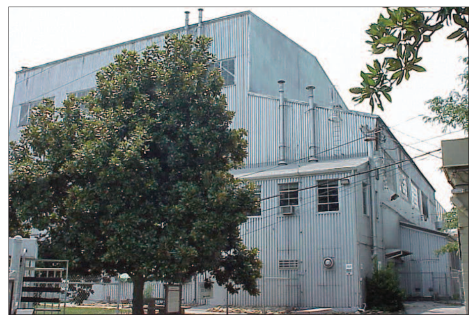
Figure 4. X-10, Code name for the Graphite Reactor (Building 3001), was built to produce fissionable plutonium.; Hillside Drive—N35° 55.68 W84° 19.06. The X-10 Graphite Reactor has been designated a historical landmark by the American Society for Metals (dedicated 1973) and the National Park Service (1966). Also, the American Chemical Society has designated the Oak Ridge National Laboratories as a National Landmark.

The analysis of the rare earths was performed in a neighboring laboratory (Figure 9) by the team of Jacob Akiba Marinsky (1918–2005), Lawrence Elgin Glendenin (1918–2008), and Charles DuBois Coryell (1912–1971). They followed the travel of various fractions by tracing their radioactivity, using the pioneering method of the Curies<sup>1a</sup> for radium and polonium. They isolated a fraction which