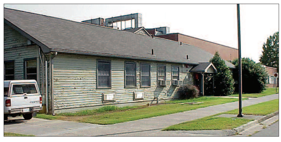
Figure 9. Chemical Analysis Building, Oak Ridge, TN, where promethium was isolated (originally the west wing of the building complex; then building #706, now building #3550, Central Ave.—N35° 55.61 W84° 18.99). The actual laboratory where the separation of promethium was done is at the far end, where now a modern brick building stands (visible behind the wooden structure).

147Pm in African pitchblende was produced predominantly by U-238 spontaneous fission – just as it was produced at the X-10 Graphite Reactor. Apparently, billions of years ago, when the concentration of U-235 was higher, there was such a natural reactor—the Oklo Reactor<sup>17</sup>—a site in Gabon, Africa, ca. 2 billion years ago. Analysis of the product shows an anomalously large concentration of samarium-147 (a beta-decay product of Pm-147), indicating that the concentration of Pm-147 was once higher at this site (but no longer).